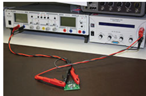
Figure 2. Practical operational setup with short twisted cables.

Figure 1 shows a schematic of the setup for evaluation of a power converter. We want to test the behavior of the power circuit and not the effect of the connection lines between the test board and the lab power supply or the load at the output. Two important measures should be taken to reduce the effects of these connection lines. For one, the connection lines should be kept as short as possible. Short lines have lower line inductance values than long lines do. Second, minimization of the current path area further reduces the parasitic inductance. An obvious way to accomplish this is to twist the lines. This results in the current path area only being dependent on the line length and the thickness of the stranded wire sheath. Figure 2 shows the connection of a test voltage converter with twisted connection lines for reduced parasitic line inductances.